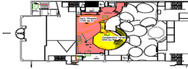
Level 08 1:200