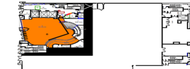
Level 01 1:200