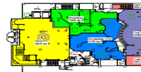
Level 00 1:200