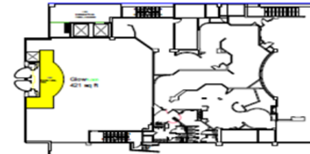
Level 00M 1:200