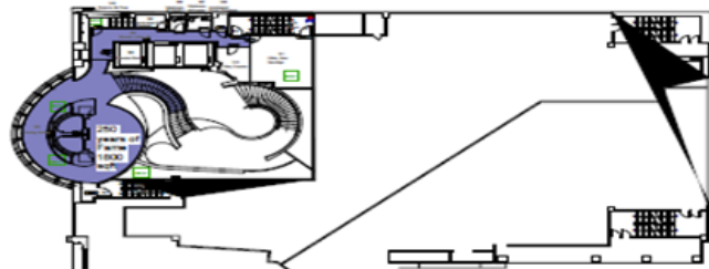
Level 03 1:200