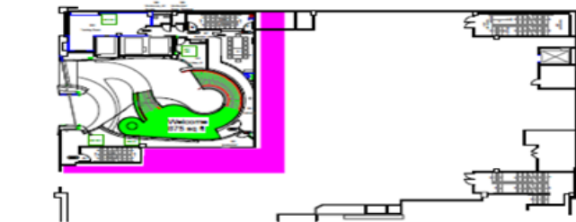
Level 02 1:200