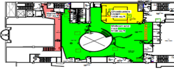
Level 07 1:200