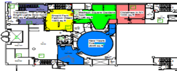
Level 05 1:200